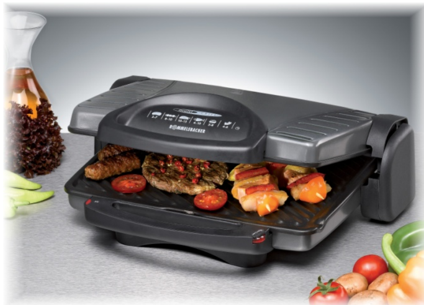
3 grill positions

The non-stick coated grill plates have a drain-channel so that healthy, low-fat grilling is possible in all positions. In addition, the grill plates are dismountable for easy cleaning. An all-rounder which should not be missing in any household!